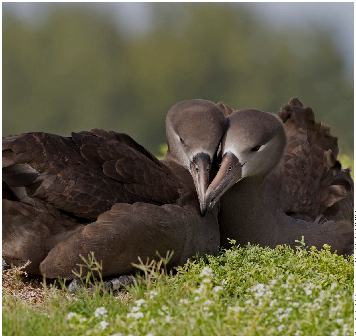
Black-footed Albatross pair

Scores ranging from one to five were assigned to each of six assessment factors, which are presented below along with scoring criteria (see Panjabi et al. 2019 for details). Data on these six factors were recently updated for shorebirds (U.S. Shorebird Conservation Partnership 2016), landbirds (Partners in Flight 2019) and waterbirds (BirdLife International 2015; Wetlands International 2015; Partners in Flight 2019; L. Wires, unpublished data).