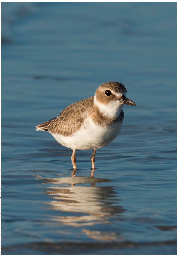
Wilson's Plover.