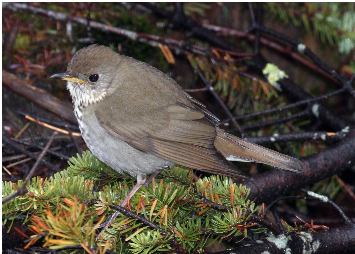
Bicknell's Thrush, Alan Schmierer/CC0 1.0