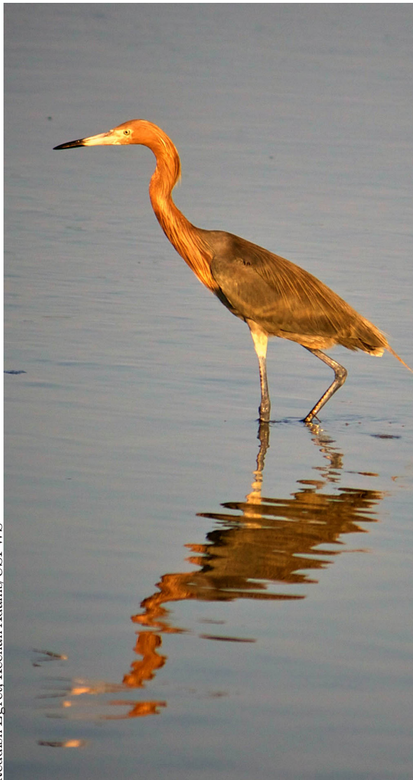
Reddish Egret