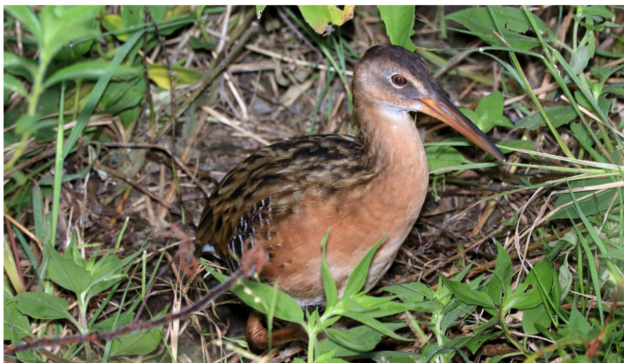
King Rail, Alan Schmitter/CC0 1.0

Navassa Island (administered by the USFWS as a NWR)