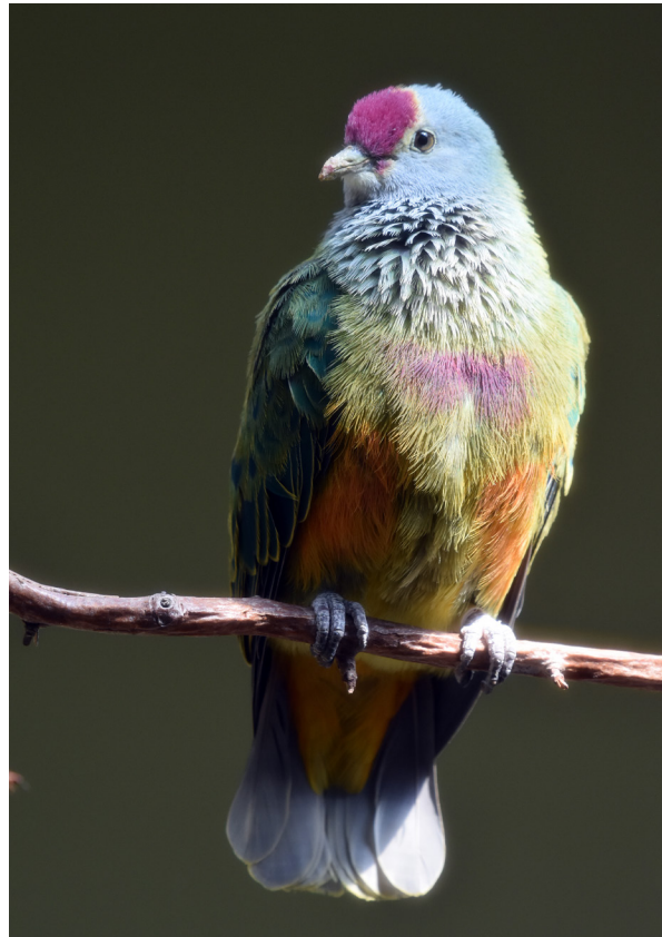
Mariana Fruit-dove