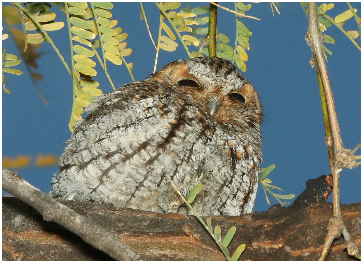
Flammulated Owl

5 Ducks; grebes; rails, gallinules and coots; limpkins; cranes; loons; storks; cormorants; pelicans; and herons and egrets.