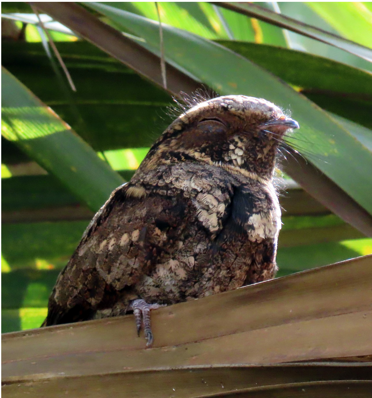
Eastern Whip-poor-will

Although all of the bird taxa included in the BCC 2021 are priorities for conservation action, this list makes no finding with regard to whether they warrant consideration for ESA listing. Our goal is to avert the need for additional ESA bird listings by implementing and coordinating implementation of proactive management and conservation actions. We recommend that these lists be consulted in accordance with Executive Order 13186, Responsibilities of Federal Agencies to Protect Migratory Birds. The BCC 2021 is intended to stimulate coordinated and collaborative proactive conservation actions among federal, state, tribal and private partners. Many of the taxa identified herein are targets of ongoing conservation attention by national and international initiatives (e.g., Partners in Flight, U.S. Shorebird Conservation Partnership), Migratory Bird Joint Ventures, state and federal natural resource agencies, NGOs, and other partnerships.