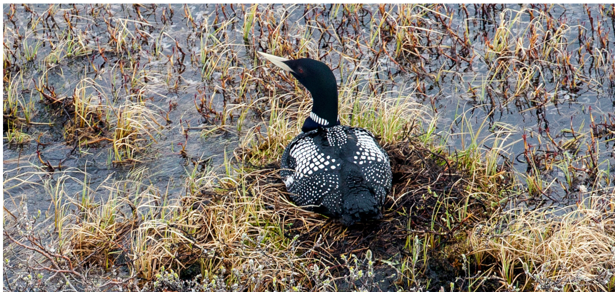
Yellow-billed Loon