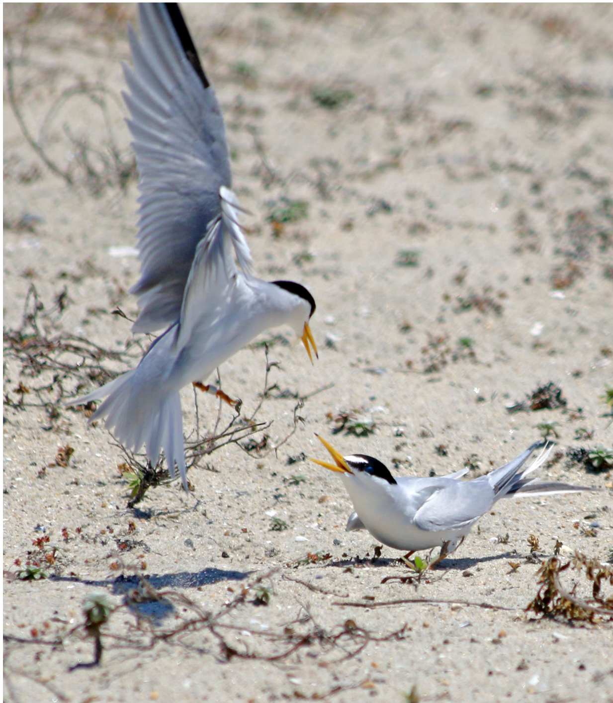
Least Tern

1 Continental list and (additional BCR-scale taxa).