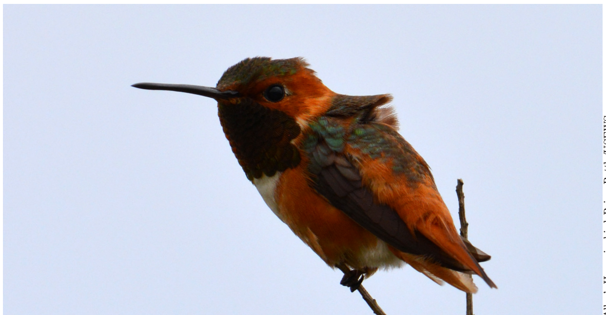
Allen's Hummingbird

Appendix 2. Numbers of Birds of Conservation Concern 2021, non-migratory birds on the Watch Lists in the 2014 State of the Birds (Rosenberg et al. 2014) or Avian Conservation Assessment Database (Partners in Flight 2019), species or populations listed as threatened or endangered under the ESA, and extinct species or populations for the Continental USA, Puerto Rico and the Virgin Islands, and Hawaii and the Pacific Islands. Shared taxa assigned to breeding area list or by greatest abundance. 47