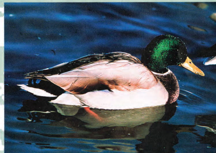
Mallards are among the most common waterfowl found on the refuge. In the spring, they can often be seen swimming in pairs.

The public is encouraged to visit the refuge and participate in the many activities designed and offered for outdoor enjoyment. Wildlife observation, fishing, hiking, nature study, and hunting of small game and deer are just a few of the opportunities available. The Visitor Center located on Highway 67 two miles west of I-65 should be the first stop for all visitors planning a trip to the refuge. At the Visitor Center, visitors can obtain information about the refuge, enjoy the exhibits, watch the orientation video, use the observation building and trails, and find out about other interesting activities that might be available.