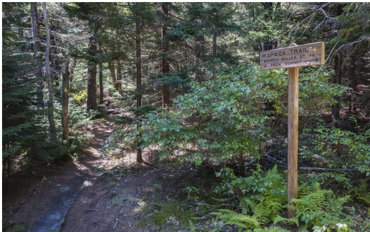
The trails feature shady forests, open vistas, and rocky outcrops.