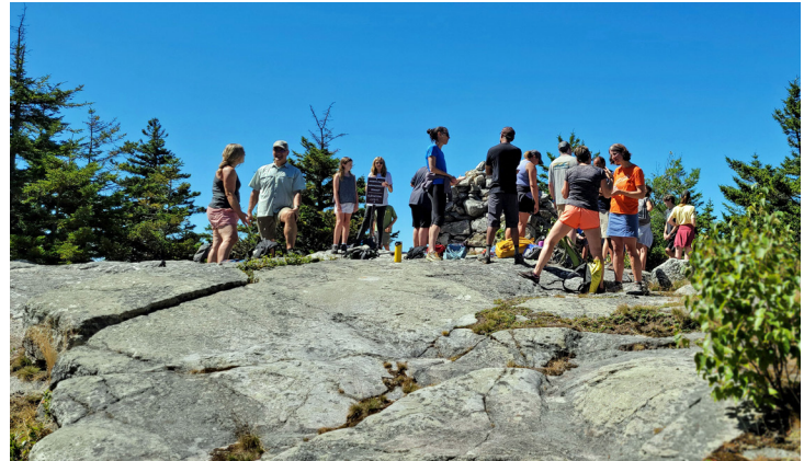
The summit provides picturesque views and a chance to rest!

Many people visit the refuge specifically to hike its trails. The final four miles of the 21 mile-long Wapack Trail begins at the southern boundary, ascends and passes over the summit of North Pack Monadnock — affording beautiful views of the landscape — before descending and continuing north to the trailhead on Old Mountain Road in Greenfield (NH). A number of other trails — Ted's, Carolyn's, and the Cliff Trail — offer additional opportunities to experience the refuge and its wildlife. Visitors generally access refuge trails either from the parking lot on Old Mountain Road or from Miller State Park.