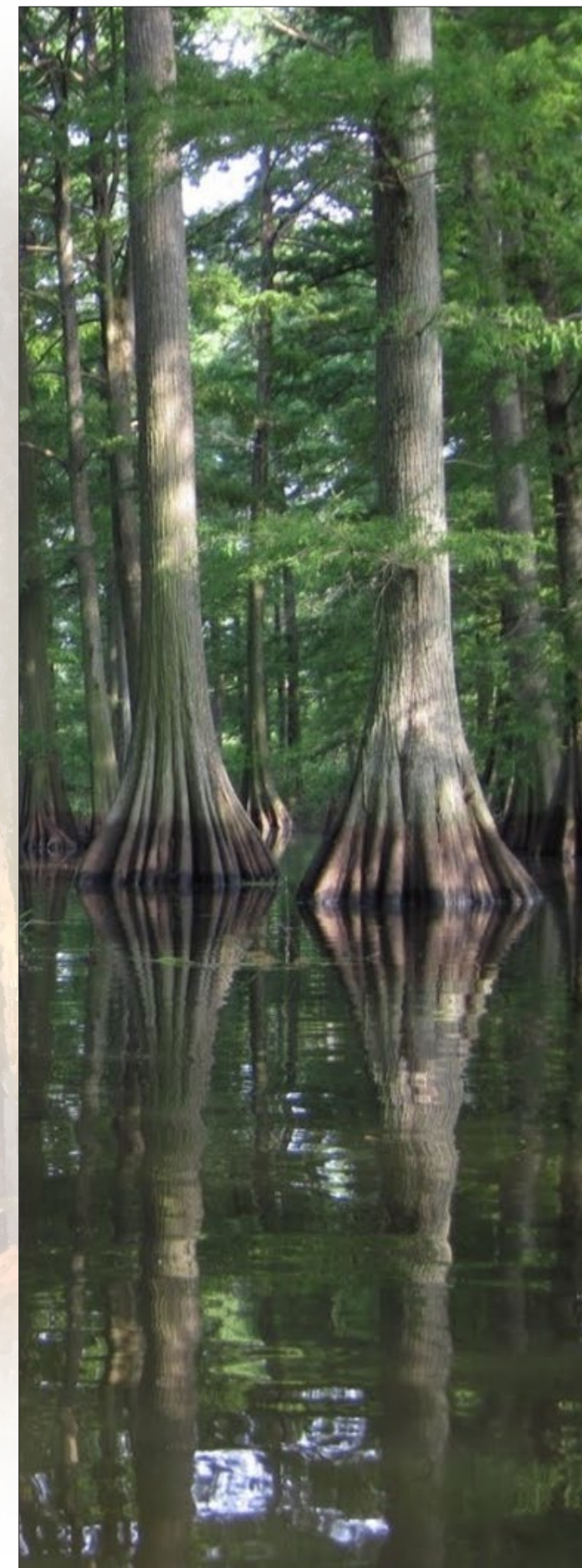
Baldcypress swamp.