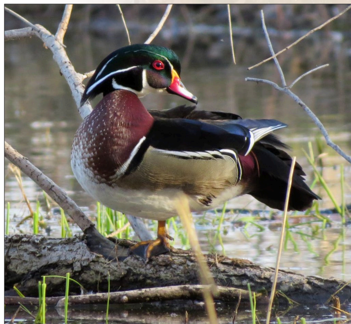
Wood duck drake.

Wapanocca Lake is an oxbow lake that formed over 5,000 years ago when the Mississippi River changed its course. Native American tribes settled in the area because of the vast resources available, with the primary village of the Pacaha tribe being located along the south side of the lake. Several hundred residents lived in this fortified village and grew corn, beans, and squash in nearby fields. The Pacaha territory extended north from Wapanocca Lake into the Missouri bootheel. This lake was part of a regionally important trading route because it was the only place in northeast Arkansas with water access to both the Mississippi River and the St. Francis River.