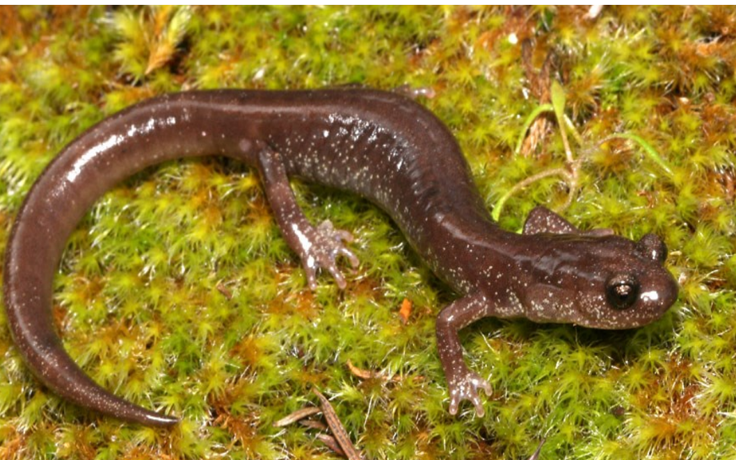
Left: A Siskiyou Mountains salamander discovered during a recent survey in its preferred habitat of moss-covered talus rocks.

- Jennifer Jones, fish and wildlife biologist