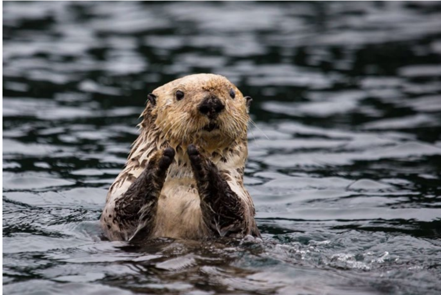
Sea otter.

A “keystone” species is a species that has an effect on its environment disproportionate to its abundance -- in other words, just a few individuals can have a big impact. The sea otter is considered a textbook example of a keystone species (e.g., Sadava et al. 2016) because of its role as a predator at the top of multiple “trophic cascades” that result in the creation and maintenance of healthy kelp forests and seagrass beds (Estes and Palmisano 1974; Estes et al. 1978; Hughes et al. 2013).