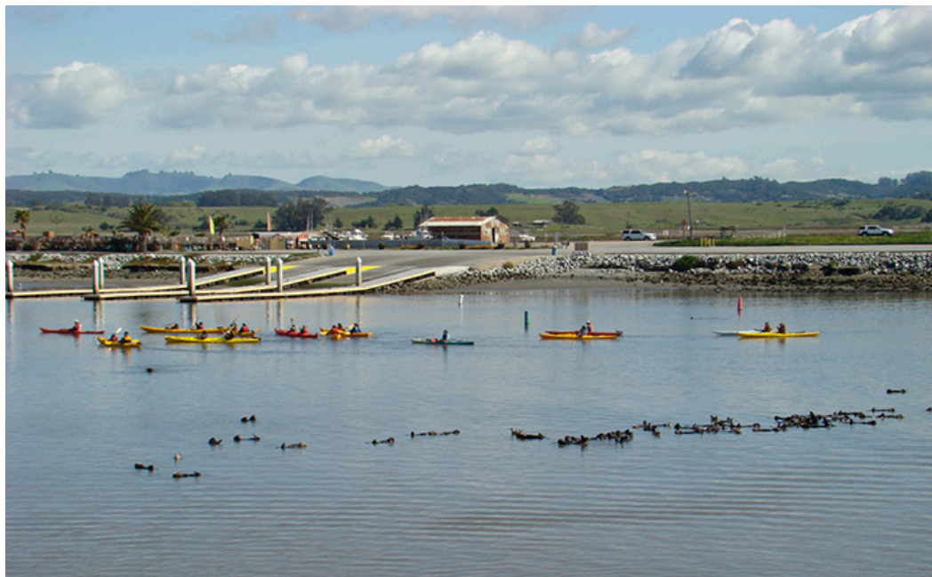
Kayakers viewing sea otters at Moss Landing in California.

Carefully laying out all of the potential costs and benefits for consideration will be an important component of the U.S. Fish and Wildlife Service's reintroduction assessment and report back to Congress.