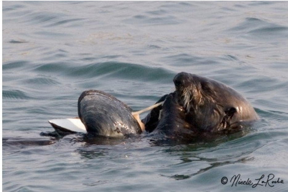
Sea otter eating clam.

Carefully laying out all of the potential costs and benefits for consideration will be an important component of the U.S. Fish and Wildlife Service's reintroduction assessment and report back to Congress.