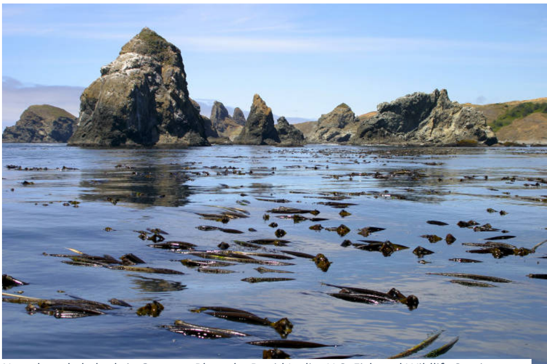
Nearshore kelp beds in Oregon.

A “keystone” species is a species that has an effect on its environment disproportionate to its abundance -- in other words, just a few individuals can have a big impact. The sea otter is considered a textbook example of a keystone species (e.g., Sadava et al. 2016) because of its role as a predator at the top of multiple “trophic cascades” that result in the creation and maintenance of healthy kelp forests and seagrass beds (Estes and Palmisano 1974; Estes et al. 1978; Hughes et al. 2013).