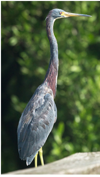
Tricolored heron