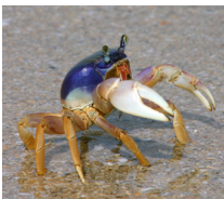
Blue land crab/ Blair Witherington