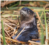
River otter