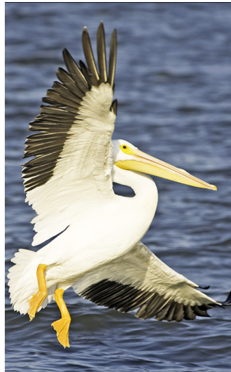
White pelican/Vince Lamb