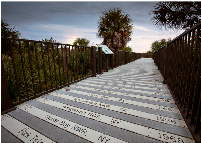
Pelican Island Boardwalk

Pelican Island National Wildlife Refuge was established as the first Refuge of the National Wildlife Refuge System on March 14, 1903 by President Theodore Roosevelt. The Refuge was established out of necessity to save the last brown pelican rookery on the east coast of Florida and provide a safe haven for other water birds that were being killed for their feathers and eggs.