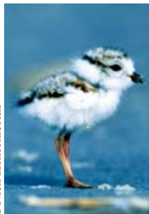
Piping plover chick

Ticks: Biting insects abound from mid-May through mid-October. Ticks occur all year, and are most active during warmer months. Some ticks may carry Lyme disease, known to be harmful to humans. When hiking, wear closed toe shoes and light colored pants, tuck pants into socks, use insect repellent.