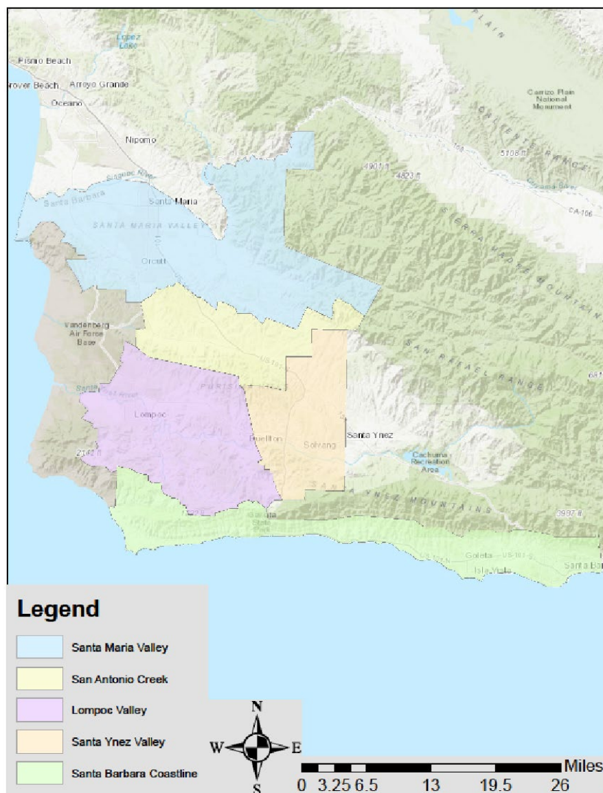
Figure 1. GCP Planning Area

Land within the Planning Area includes developed oil and gas fields, undeveloped land, agricultural lands, and rural and urban development. The Planning Area encompasses diverse