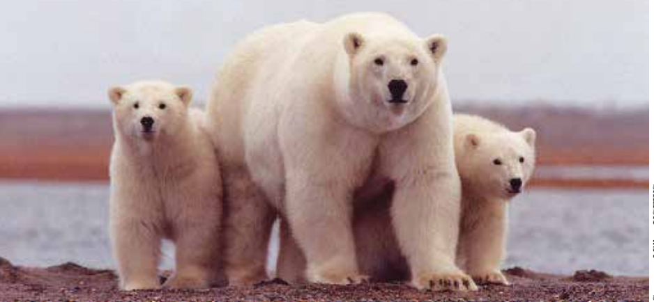
Listed in 2008 as threatened because of the decline in sea ice habitat, the polar bear may spend time on land during fall months, waiting for ice to return.

A species is listed under one of two categories, endangered species or threatened species, depending on its status and the degree of threat it faces. An "endangered species" is one that is in danger of extinction throughout all or a significant portion of its range. A "threatened species" is one that is likely to become endangered in the foreseeable future throughout all or a significant portion of its range. To help conserve genetic diversity, the ESA defines "species" broadly to include subspecies and (for vertebrates) distinct populations.