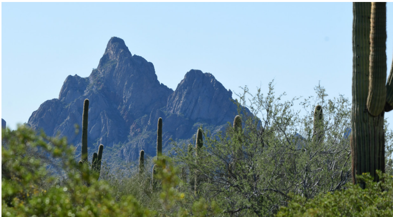
A trip down Charlie Bell Road offers stunning views of the Growler Mountains. Keep a lookout for wildlife. You may catch a glimpse of Sonoran Desert residents such as coyote, kit fox, and desert bighorn sheep.