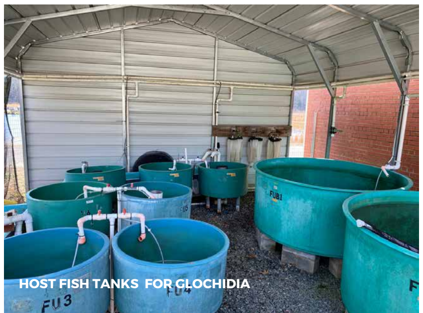
HOST FISH TANKS FOR GLOCHIDIA