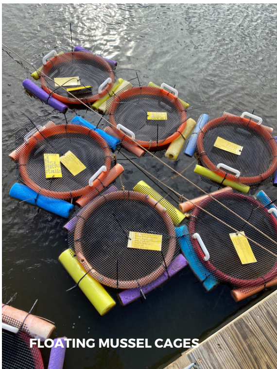
FLOATING MUSSEL CAGES

Harrison Lake produces millions of native mussel glochidia on a shoestring budget and ingenuity. It truly is that necessity breeds innovation. I'm hoping we can use a similar approach as we invest millions into LSRCP - keep stretching our imaginations and let's turn millions of greenbacks into salmon backs!